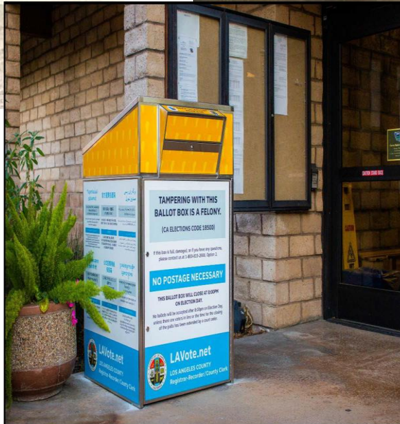
Picture of 24-Hour VBM Drop Box

The location at NCC is on the sidewalk at the northside entrance, where the roundabout parking lot is located off of 162 nd Street