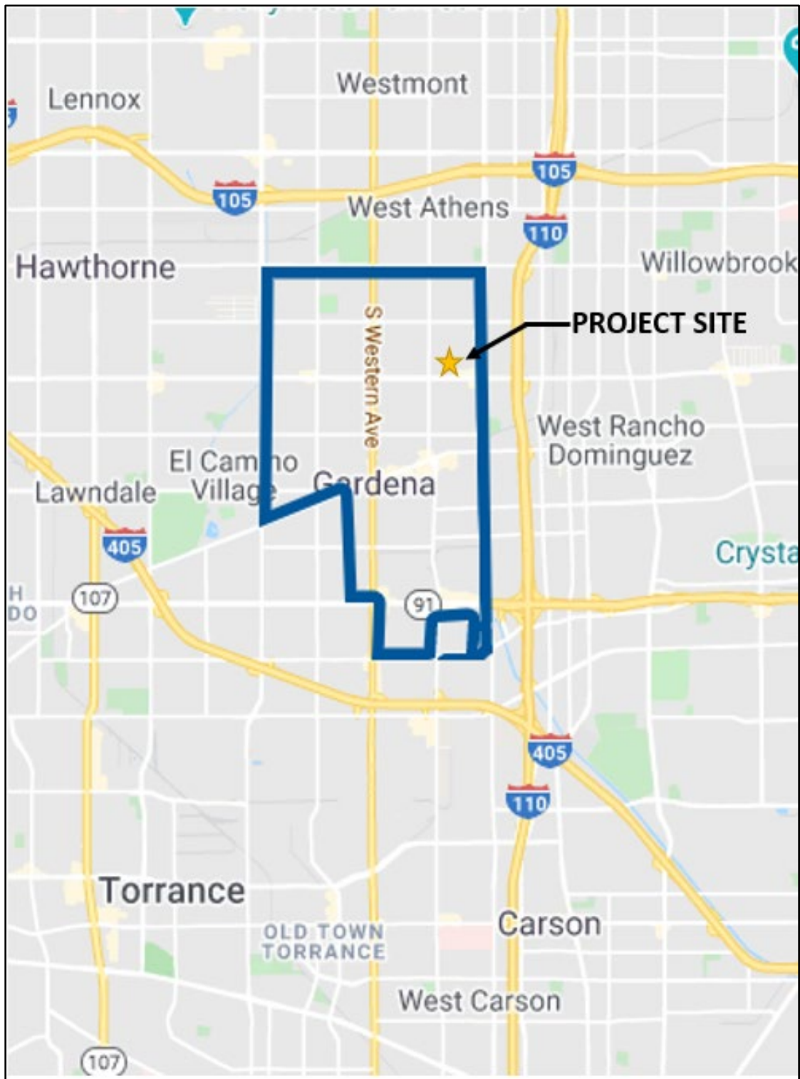
Figure 1. REGIONAL VICINITY MAP